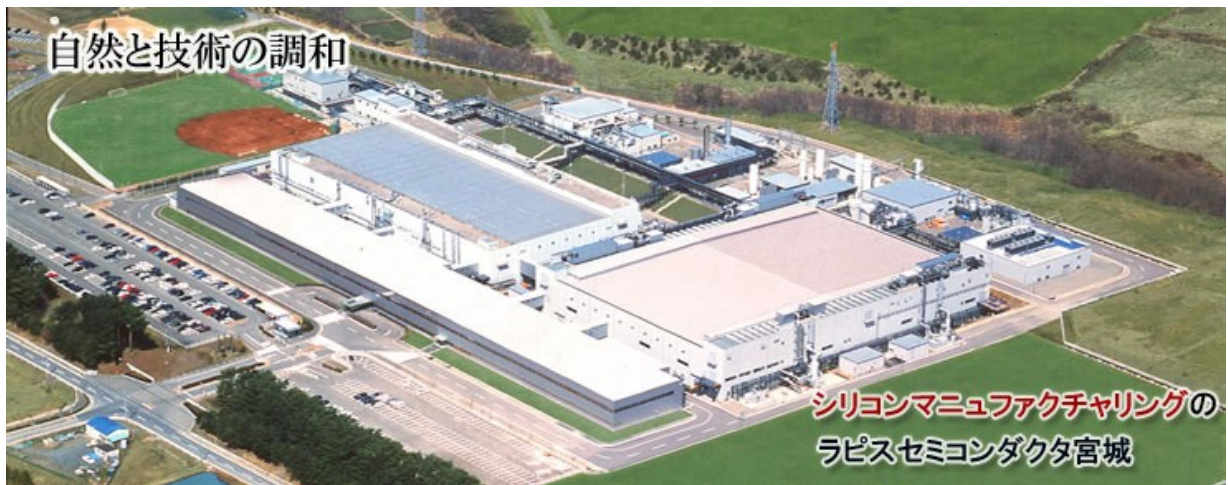
Lapis Miyagi Co. Ltd. Okino Taira 1, Ohhira-Mura, Kurokawa-Gun, Mitagi Pref.